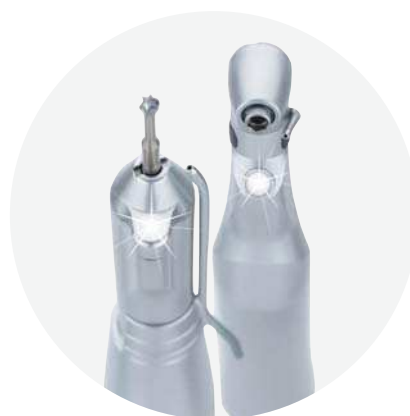
S-11 LED G WS-75 LED G