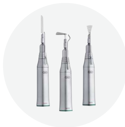
S-8 R S-8 O S-8 S

removal with sagittal, oscillating or reciprocal movement. Whichever direction you choose: with W&H, you will have a reliable partner at your side.