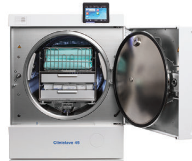
An instrument basket (W x H x D = 28 x 14 x 57 cm) and two trays (each 31 x 5 x 59 cm)