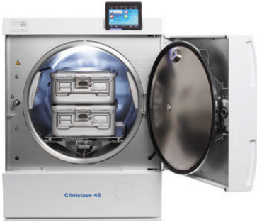
Two half containers ½ StE (each 30 x 15 x 60 cm)