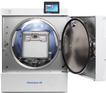
A whole sterilization container (W x H x D = 30 x 30 x 60 cm)