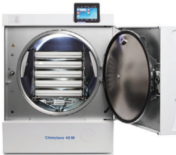
15 dental containers (each 31 x 5 x 19 cm)