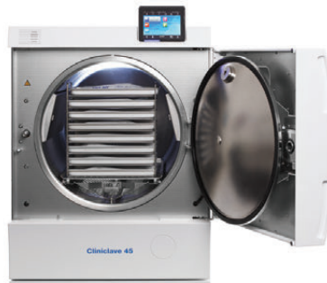
24 dental trays (each 19 x 2 x 29 cm)